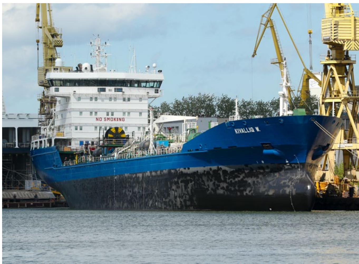
The tanker Kivalliq W. has been retrofitted with a BWT System at Remontowa

The Searanger underwent an intermediate survey. In addition to hull maintenance,